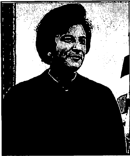
CONSTANCE BAKER MOTLEY